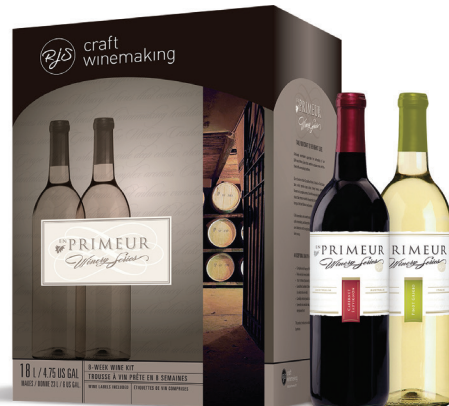
*labels included; bottles, corks, and shrinks sold separately.

Each kit contains 16 or 18 liters of superior quality varietal grape juice and concentrate that, in as little as 6 to 8 weeks, will make 23 liters of your very own exceptional craft wine.