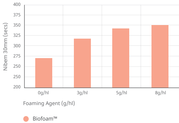
Figure 1: Foam stability

Biofoam™ resulted in an increase of up to 41% in foam stability.